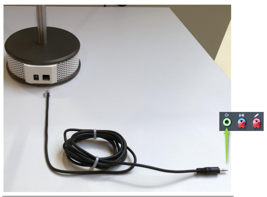
Figure 4 Jack plug cable

The jack plug cable connects to the sound output of the target system (light green socket).